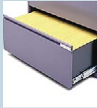
CONVENTIONAL 4-DRAWER FILE CABINETS