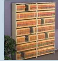
L&T 4 POST SHELVING